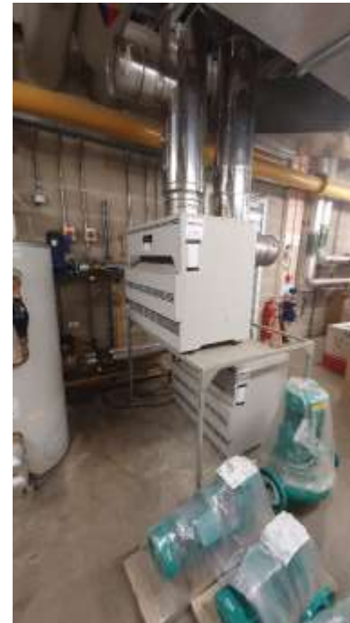
kW demand *** College May 2019